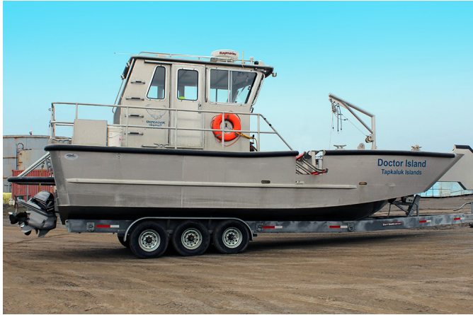
M/V Doctor Island: 32' Munson landing craft with twin, 330hp Volvo diesels.

Bowhead Transport also has a fleet of smaller, specialized, shallow-draft coastal and river lighterage vessels available to customers for their marine needs.