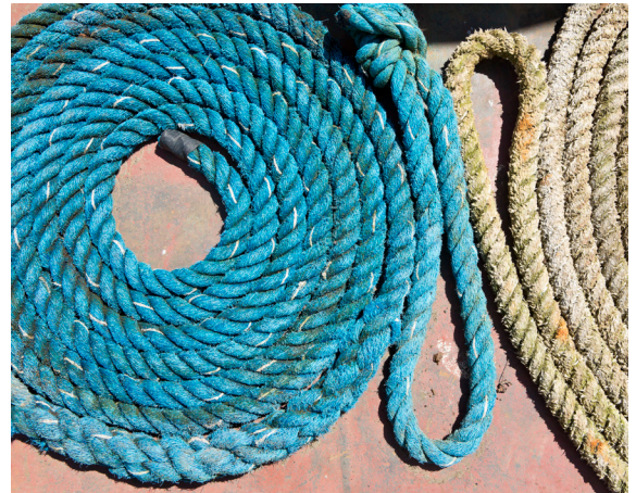
Experienced crew members are licensed to meet all safety and client expectations.

Bowhead Transport, LLC was named for the great Bowhead whale which has been a time-honored traditional source of valuable sustenance to the Inūpiat people for thousands of years.