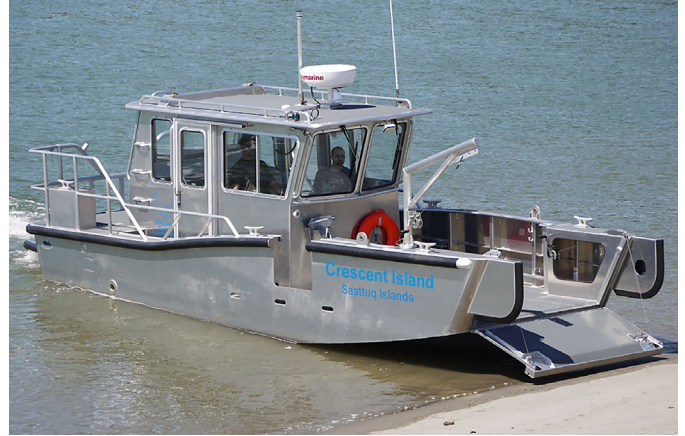
M/V Crescent Island: 26' Munson landing craft with twin, 225hp Volvo diesels.