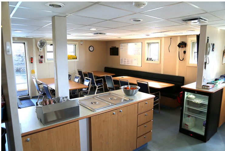
With seating for 18 or more, the galley serves as a meeting area as well as a dining area.