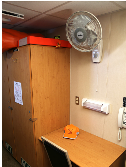
Plenty of storage for crew and passenger's belongings as well as desks and inner-ship communication phones.