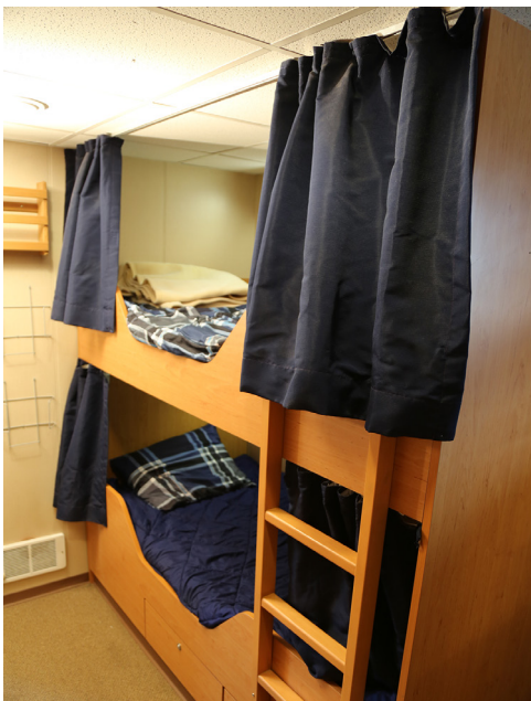
Comfortable sleeping accommodations and bathroom/shower facilities for crew and 16 passengers.