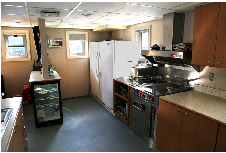
The galley consists of a full kitchen that includes a propane stove, several refrigerators and freezer, dishwasher, sinks, food warming servers and even a deep fat fryer.