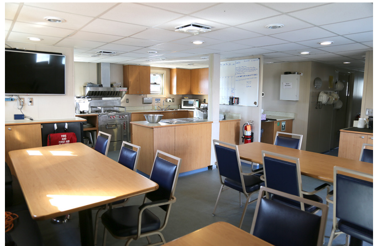
Complete with communications capabilities and a flat screen television, the galley provides the comforts of home for passengers and crew.