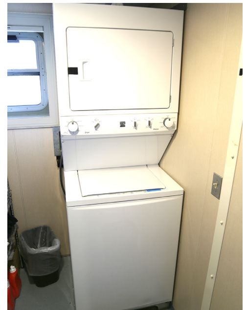
Washer and dryer on board.