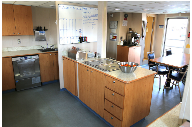
There is an oven and lots of storage space for cooking utensils, plates, bowls, silverware, etc. There is also the all important coffee maker.