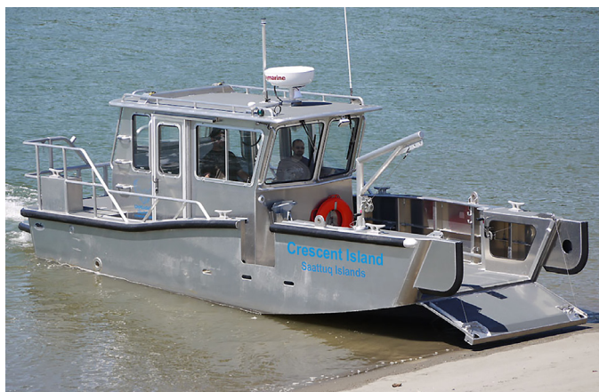
M/V Crescent Island: 26' Munson landing craft with a 450hp inboard motor.