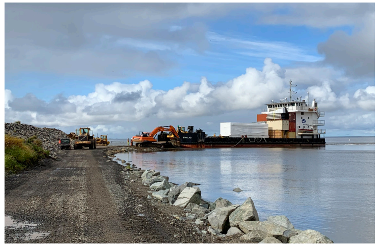
M/V Unalqa at the barge landing in Mertarvik, Alaska, dropping off a new power module, equipment and supplies.