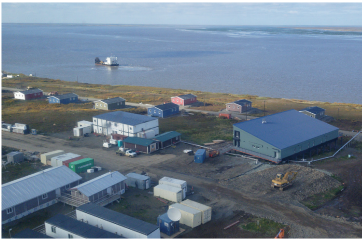
An aerial view of the M/V Unalqa on one of many trips to Mertarvik, Alaska during the 2018/2019 construction to accommodate the residents of a neighboring village being evacuated due to rising water levels.