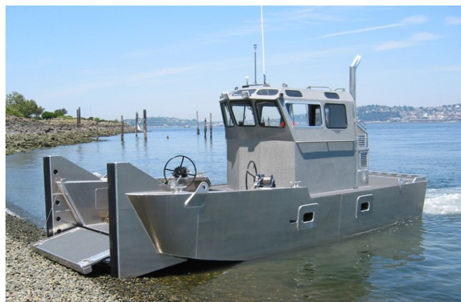
M/V Inutuq II: 30' shallow draft push boat.

Bowhead Transport, LLC was named for the great Bowhead whale which has been a time-honored traditional source of valuable sustenance to the Inupiat people for thousands of years.