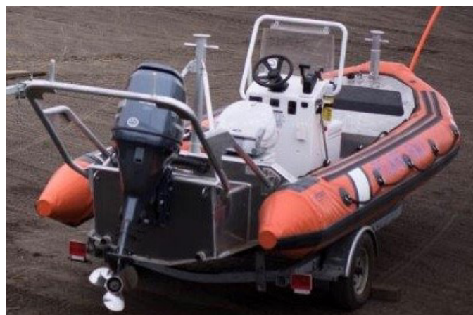
18' Rigid Hull Inflatable skiff with a 90hp outboard motor.