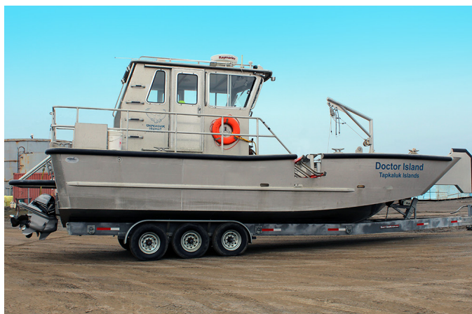
M/V Doctor Island: 32' Munson landing craft with a 660hp inboard motor.

Bowhead Transport also has a fleet of smaller, specialized, shallow-draft coastal and river lighterage vessels available to customers for their marine needs.