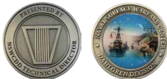
Challenge coin presented to Team Bowhead for their exceptional work.

Bowhead Total Enterprise Solutions, LLC (BTES) supports the Mission Capability and Sustainment Support (MCSS) at the Naval Surface Warfare Center – Dahlgren Division (NSWCDD).