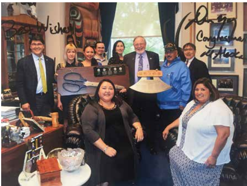
Presenting Congressman Don Young with commemorative scissors and ulu for taking part in the ribbon cutting ceremony for a new street in Barrow.