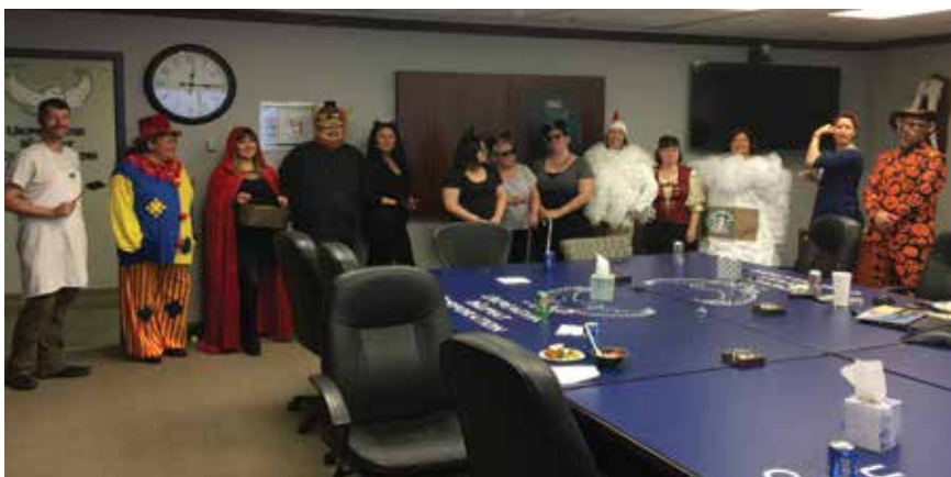
On October 31st the UIC Calais staff enjoyed a Halloween potluck lunch and costume contest.