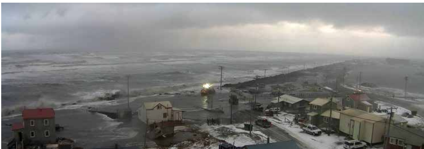
High winds and waves in Barrow on September 29th as seen from the Barrow sea ice cam.