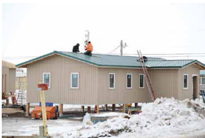
One of five (5-Star) rated homes built by UIC Iglu Services.

Directions to one of the homes: Take Qaiyaan Street and turn on Utigtug. On Utigtug the house will be the second building on your left-hand side. This home is a 1272 square foot, 5-star energy rated home that features three bedrooms with a full guest bathroom as well as a master bathroom. The open floor plan provides free flowing movement from the kitchen and living areas to all bedrooms. The kitchen has cherry wood cabinetry with a paprika finish. All appliances are stainless steel. Plus there is a large walk-in cupboard. The main living area and kitchen have laminate flooring for easy clean up and the bedrooms are carpeted. Do not miss your chance