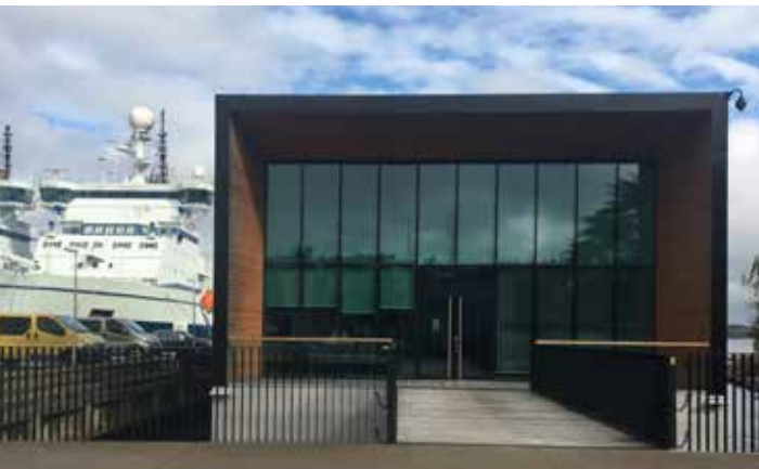
The visit to Helsinki also included a tour of a "floating" office building.