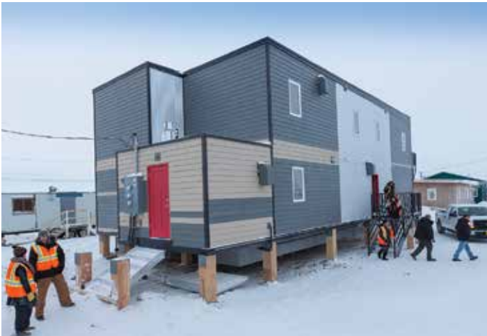
UIC Iglu Services built this duplex plus 5-of-10 new 5-star energy rated homes in Barrow in 6 months to help offset the current housing shortage in Barrow.