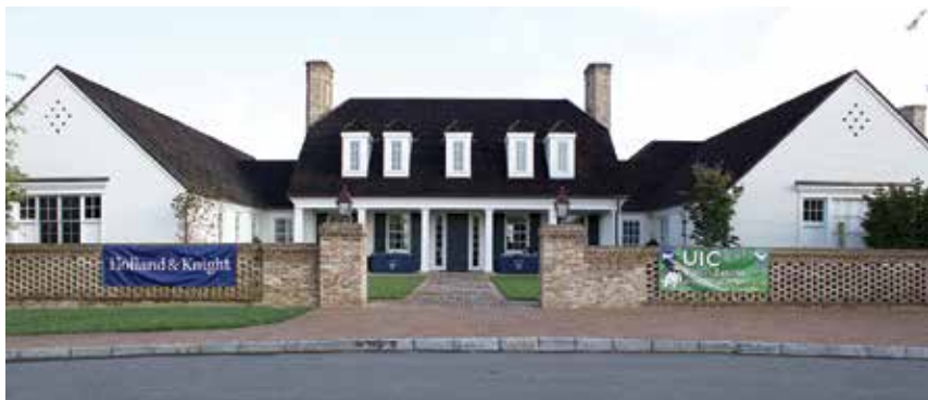
Potomac Shores Golf Club , the UIC Government Services' 7th Annual UIC Foundation Benefit Golf Tournament location.