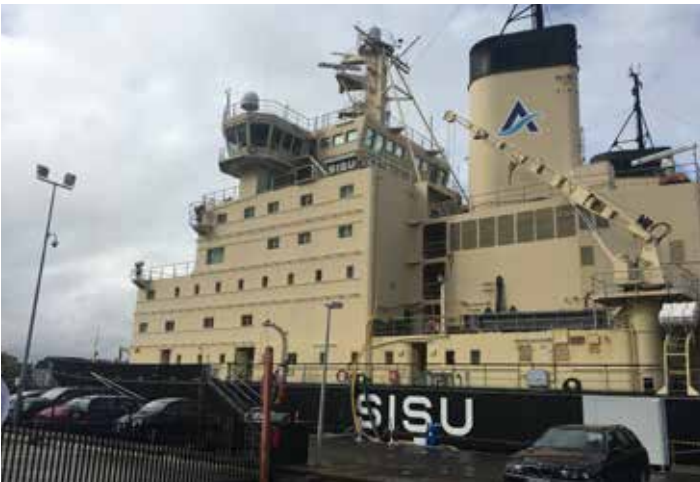
The UIC president and other executives toured an Ice Breaker while attending the Arctic Energy Summit in Helsinki, Finland in September.