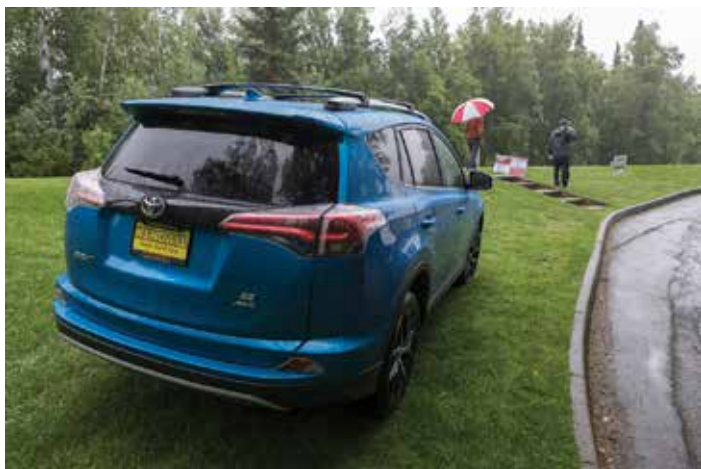
Hole-in-One prize at the Anchorage tournament.